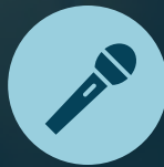
HPBC Worship Choir