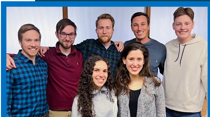
Athens Mission Trip