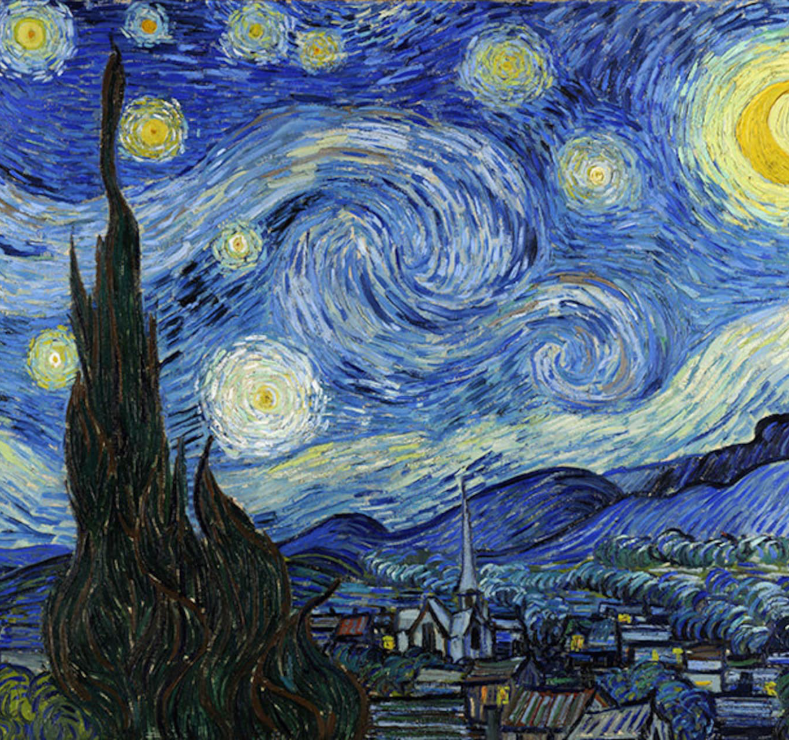
Van Gogh's "Starry Night"